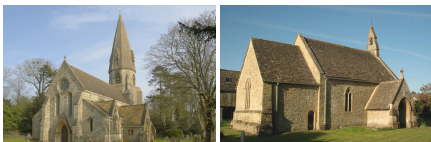
St. Michael & All Angels LEAFIELD

The services are very family-friendly and easy to follow. We warmly invite you and your families to discover God's message for us all. Everyone is welcome!